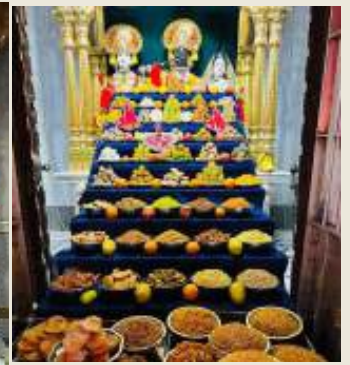
AnnakutDarshan in Mathura temple on the occasion of Patotsav