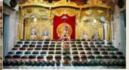
Annakut of Tarbuch in Naranpura temple.