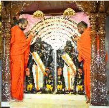
Kesar-Snan Abhishek Darshan in Gandhinagar Sector-2 temple.