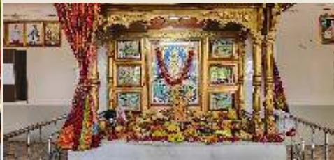
Amrotsav in Nandol temple.