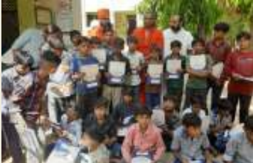
Distribution of books in Gandhinagar Sector-2 temple.