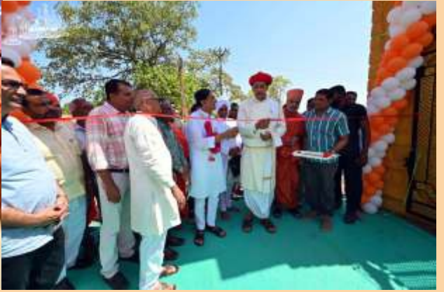
બાયડ મંદિરમાં મૂર્તિ પ્રાણ પ્રતિષ્ઠા વિધિ કરતા તથા મંદિરનું ઉદ્ઘાટન કરતા પ.પૂ. આચાર્ય મહારાજશ્રી