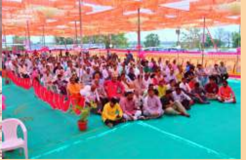
બારા દેવીયા (મોડાસા) મંદિરમાં મૂર્તિ પ્રતિષ્ઠા કરતા તથા સભામાં આશીર્વાદ આપતા પ.પૂ. મહારાજશ્રી