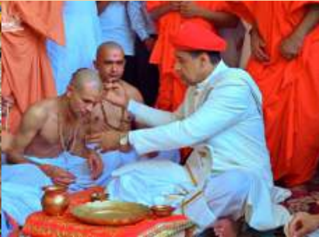
આપણા કાલુપુર મંદિરમાં અગિયારસના દિવસે મુમુક્ષુઓ ને સંત મહાદીક્ષા આપતા શ્રી નરનારાયણદેવ દેશ પીઠાધિપતિ પ.પૂ. આચાર્ય મહારાજશ્રી