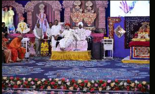
H.H. Shri Acharya Maharaj performing Murti Pratistha in temple of ladies devotees in Kholadiyad (Muli Pradesh) and granting blessings in the Sabha.