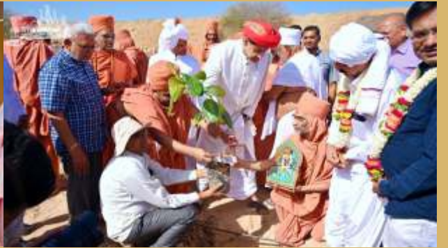
નારણપર (કચ્છ) મંદિરના પાટોત્સવ પ્રસંગે ઠાકોરજીનો અભિષેક કરતા તથા વૃક્ષારોપણ કરતા પ.પૂ. આચાર્ય મહારાજશ્રી સાથે ભુજ તથા અમદાવાદ મંદિરના મહંત સ્વામી