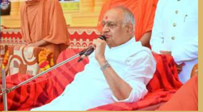
માંડવી (કચ્છ) મંદિરનો રજત જયંતી મહોત્સવ સમગ્ર ધર્મકુળનાં સાંનિધ્યમાં ઉજવાયો