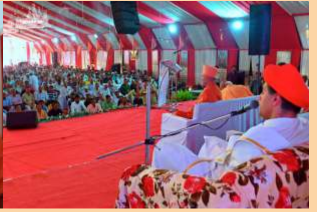
પાટણ મંદિરમાં મૂર્તિપ્રતિષ્ઠા વિધિ કરતા અને સભામાં આશીર્વાદ આપતા પ.પૂ.આચાર્ય મહારાજશ્રી