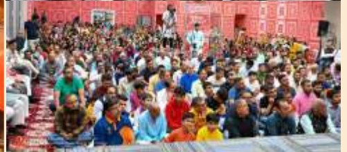
Darshan of 20th Patotsav of I.S.S.O. Sydney, Black Town (Australia) temple.